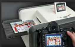
Direct Wireless Printing